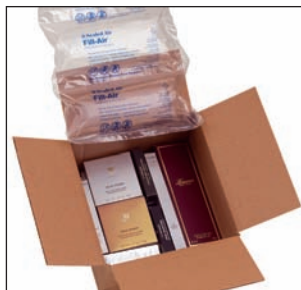
Fill-Air® Inflatable Packaging Systems