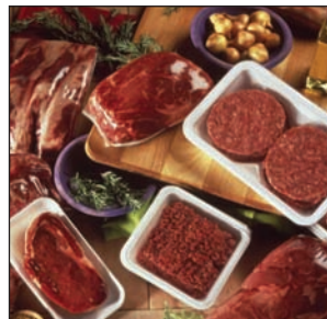
Cryovac® Food Packaging