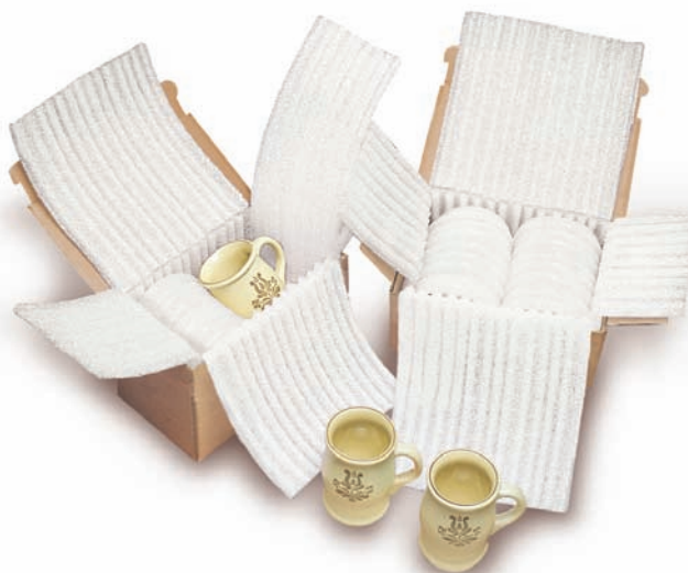
Corro-Foam™ ribbed foam provides extra protection for fragile items.