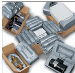
Instapak® Foam Packaging