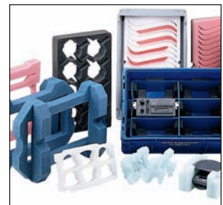
CelluPlank® Cellu-Cushion® ETHAFOAM® Stratocell® Polyolefin Fabrication Foams