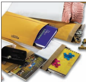
Jiffy Mailer® Products