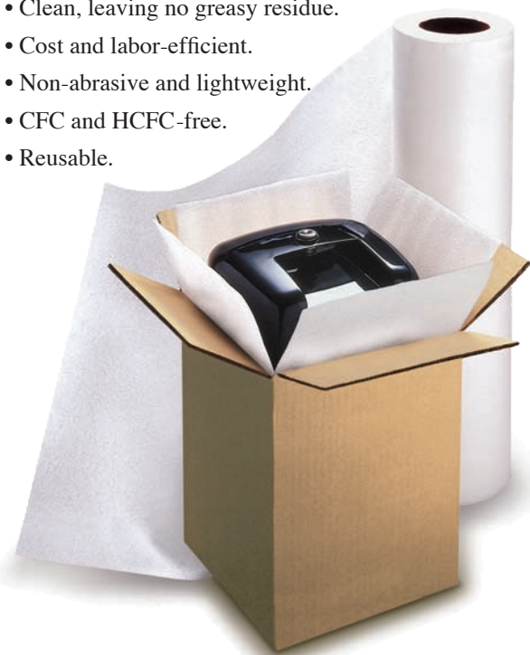
Cell-Aire® foam offers excellent surface protection for a wide range of products including injection molded parts.