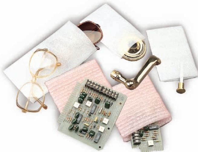
Cell-Aire® foam pouches are a fast, efficient way to package.