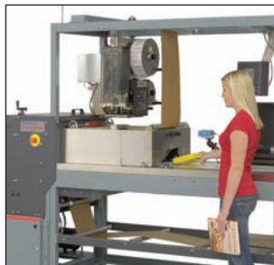
PriorityPak® Automated Packaging Systems