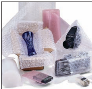
Bubble Wrap® Brand Cushioning

Sealed Air's industry-leading investment in research and development and constant focus on World Class Manufacturing principles allow us to continue to deliver innovative packaging solutions that add measurable value to our customers' businesses around the world.