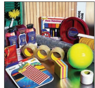
Cryovac® Performance Shrink Films